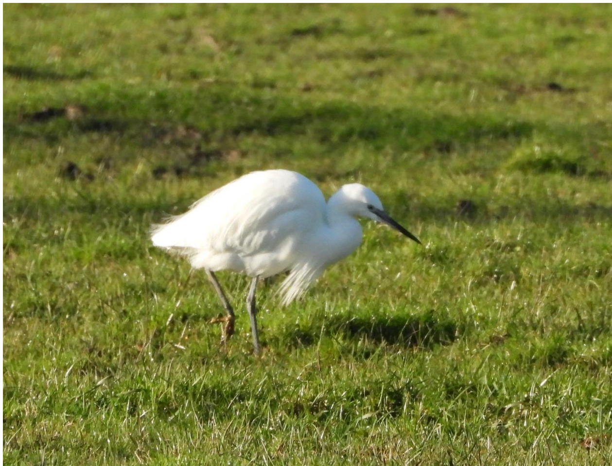
John Lower saw this Little Egret (one of three) mixing it with some rooks in the field next to Shireoaks Top Lock.