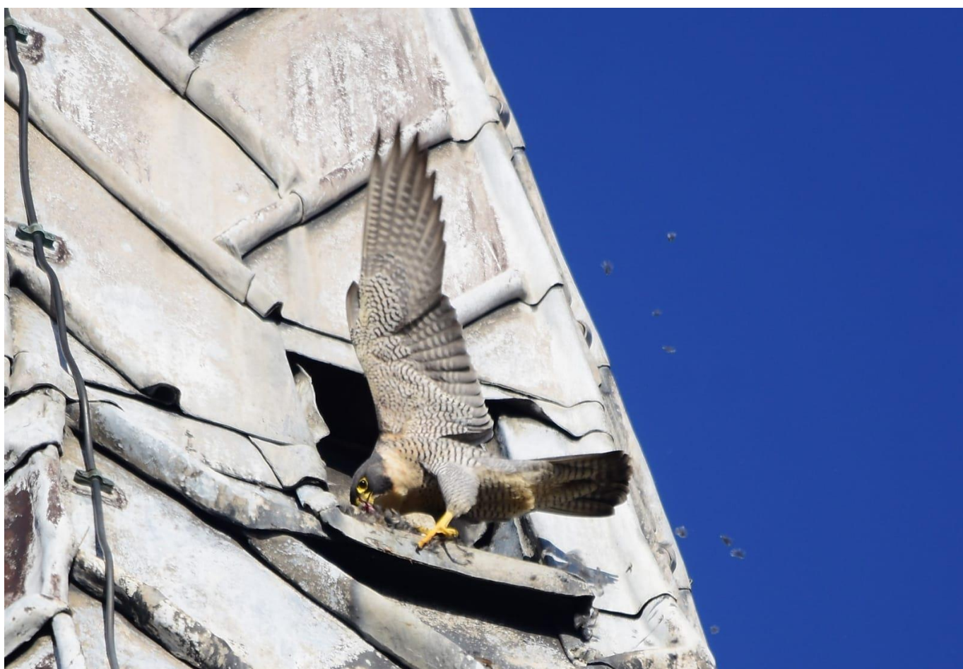
Not on the canal, but it's good to know that the Peregrine Falcon is back at the Crooked Spire in Chesterfield. Another superb photo from Andrew Scott.