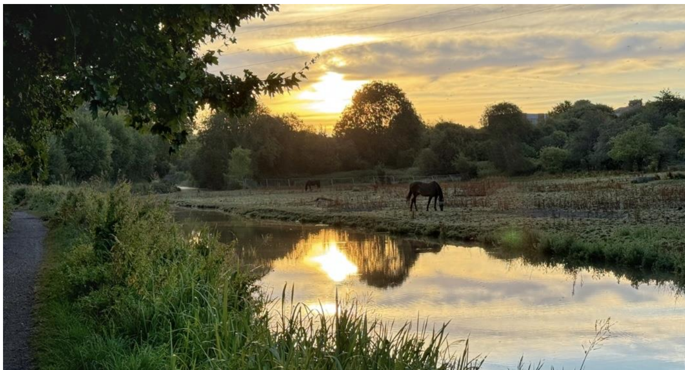
Alan Wood took this shot of horses at dawn at Staveley.