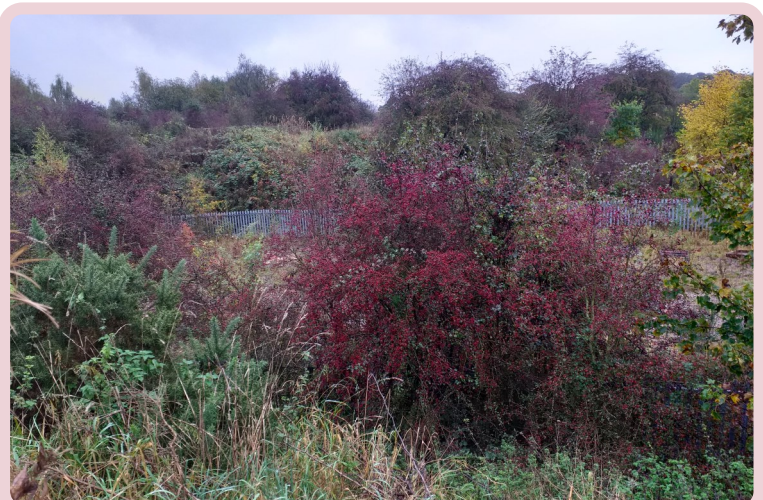
Some of the route needs to be cleared of vegetation

However, some works are unavoidable. We are also making sure that we mitigate any loss with planting of new, native species at the end of the works.