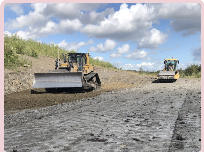
Trialing the re-working of the donated clay

Most of the canal will be constructed on a large embankment, historically known as the Puddlebank. It is formed of clay, but as the valley has suffered from a lot of mining subsidence, we need a lot more clay than is on site. A local landowner, Suon, has donated a massive stockpile of clay to the project, and we have done a trial to determine how best to place the material.